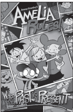
Volume 4: When the Past is a Present ISBN 9781416986072