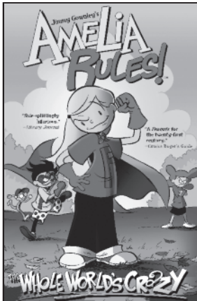
Volume 1: The Whole World's Crazy ISBN 9781416986041

“A character to rival Ramona.”— School Library Journal