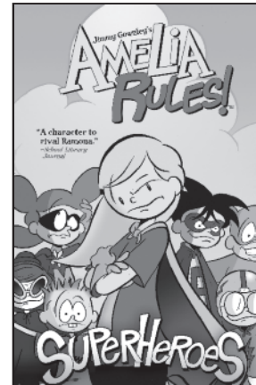
Volume 3: Superheroes ISBN 9781416986065