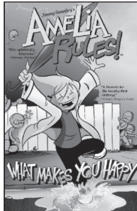
Volume 2: What Makes You Happy ISBN 9781416986058