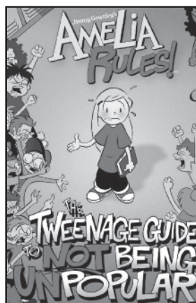
Volume 5: The Tweenage Guide to Not Being Unpopular ISBN 9781416986102 (HC) ISBN 9781416986089 (PB)