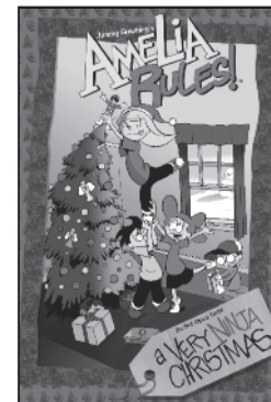
A Very Ninja Christmas ISBN 9781416989592

SIMON & SCHUSTER CHILDREN'S PUBLISHING ATHENEUM BOOKS FOR YOUNG READERS 1230 Avenue of the Americas, New York, NY 10020 TEACH.SimonandSchuster.net • AmeliaRules.com